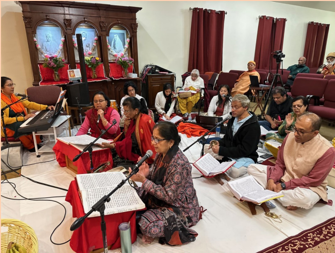
Sri Akhanda Ramayana Recitation