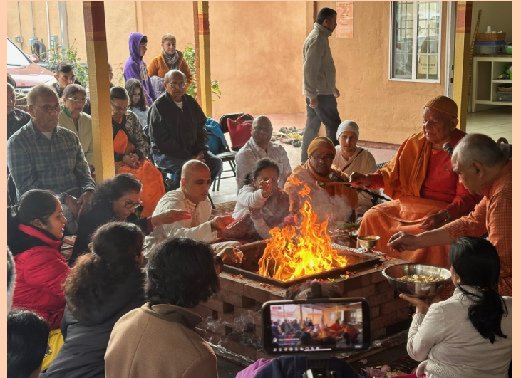
Sri Ganesha Homa

The annual Sri Akhanda Ramayana recitation began Saturday, Jan. 4th and concluded Jan. 5th. For nearly 30 consecutive hours devotees from all over the Bay Area joined in Badarikashrama to sing and chant the entire Sri Ramacharitamansa of Goswami Tulsidas. Many groups led the recitation with beautiful melodies. As the program drew to an end there was a tremendous feeling peace and joy.