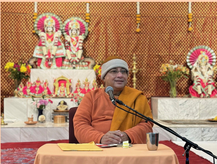
Sri Akhanda Ramayana Recitation