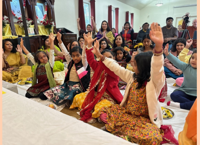
Sri Saraswathi Puja