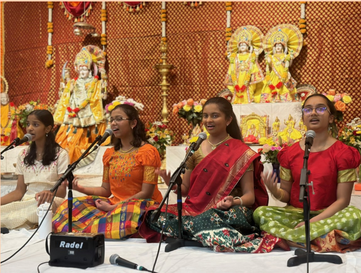
Hari Dasa Day Performance

of devotion. The Haridasa movement was a devotional movement that originated in Karnataka in the 13th and 14th centuries. The movement's goal was to spread the Dvaita philosophy of Madhvacharya through literature, music, and social change. Composers included Purandaradasa, Kanakadas and Vyastirta to name a few.