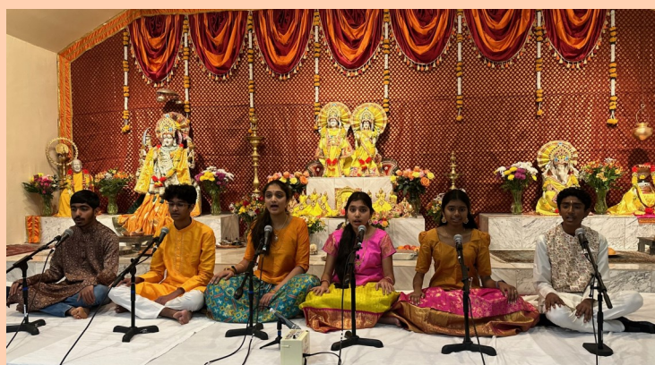
Hari Dasa Day Performance