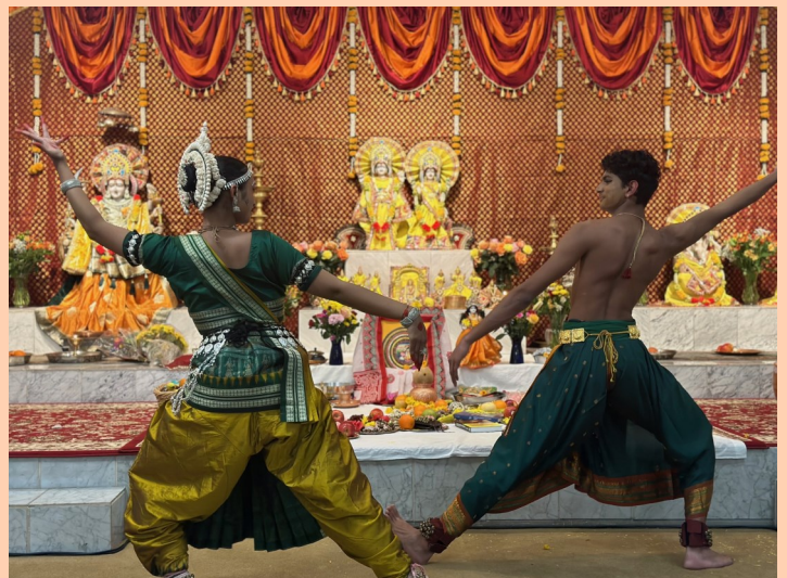
Sri Saraswathi Puja Bharatanatyam Performance

Gunguru's (sacred anklets for dancers), books, instruments, etc. were placed before the altar to be blessed by Devi Saraswathi, the goddess of art and learning. Following the puja were a veena and bharatanatyam dance performance. Sunday Feb. 2nd, artists throughout the Bay Area performed Canatic music for our annual Hari Dasa Day. Music filled the air, the ashrama brimming with the spark