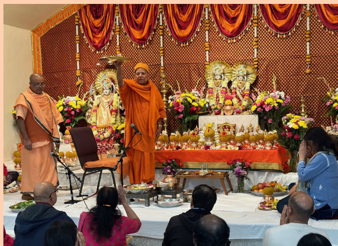
Samuhika Satyanarayana Puja