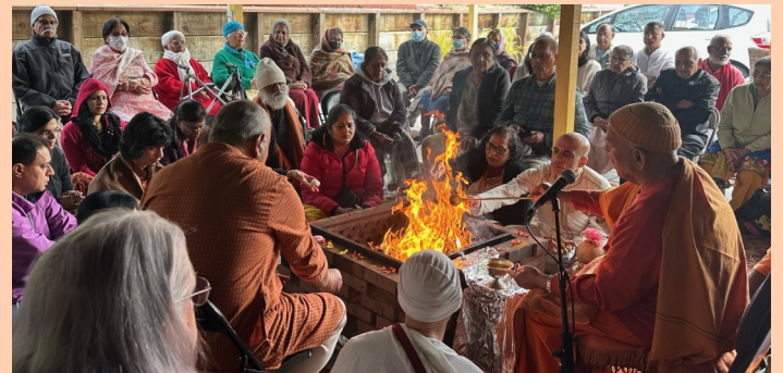
Sri Ganesha Homa