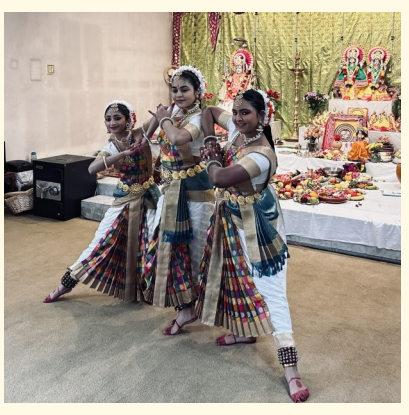
Kuchapudi dance to celebrate Sri Saraswathi Puja